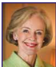
Her Excellency Ms Quentin Bryce AC Governor-General of the Commonwealth of Australia