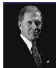
The Hon Michael Kirby AC CMG