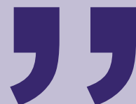
Cathy Freeman, OAM Olympic Gold Medallist

I am proud to be an official Conference Ambassador for the 5th IWG World Conference on Women and Sport which will focus on creating positive change for women and sport globally. The conference aims to empower women from every walk of life to realise their full potential just as I was able to as an athlete.